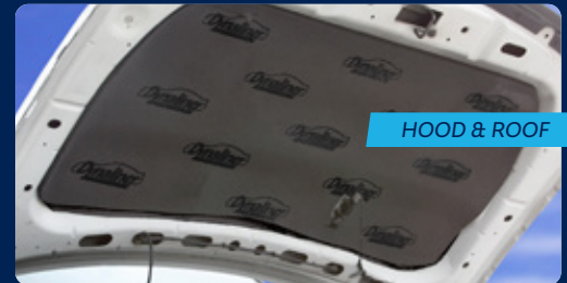
HOOD & ROOF