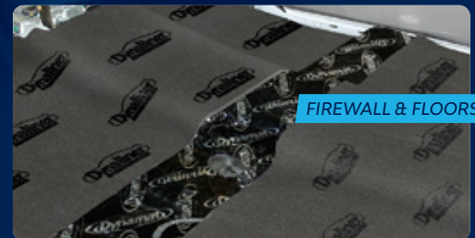
FIREWALL & FLOORS