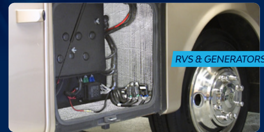
RVS & GENERATORS